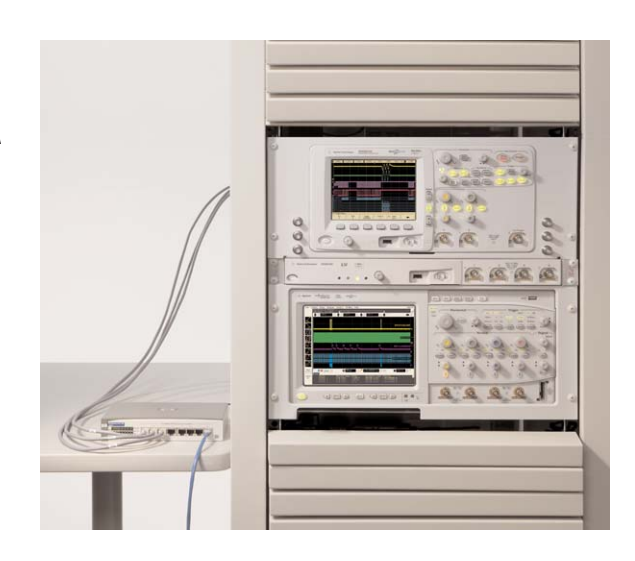
Figure 2. Spanning 100 MHz to 1 GHz, and varying in height from 1U to 5U, Agilent's 6000L and 6000A LXI class C compliant oscilloscopes can accommodate many automated testing applications.

intentionally chose to leave a few slots empty for future enhancement or extension. With LXI, future test system additions will be easier and the system will consume only the space you need.