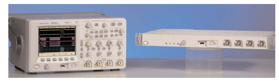
Figure 1. The 6000A and 6000L Series from Agilent Technologies are 100% software compatible, enabling smooth test system transition from R&D to manufacturing.

Because the 6000A and 6000L are completely software compatible, the manufacturing team can use the software and test routines developed in R&D without any major modification. That's a very big opportunity to reduce the time and money spent moving from R&D to manufacturing.